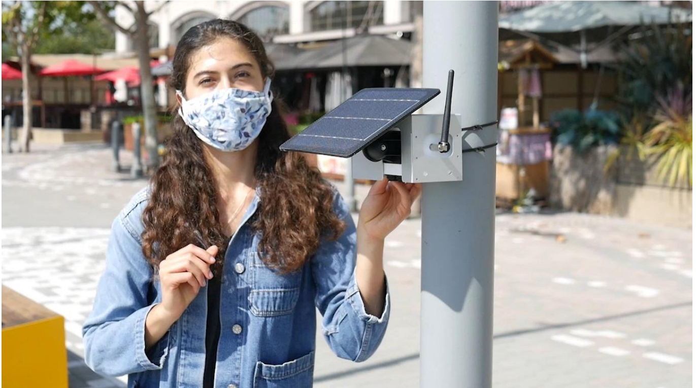
A Node-S Clarity Sensor used in the Breathe London network.

Breathe London (2019 to present) is a ‘hyperlocal’ air quality monitoring project that has used a large network of smart low-cost air quality sensing devices to measure various air pollutants (particulates and gases) in multiple local boroughs across Greater London. The project has been delivered by an evolving coalition of government, university, NGO, and industry partners, and is currently managed by the Environmental Research Group at Imperial College London .