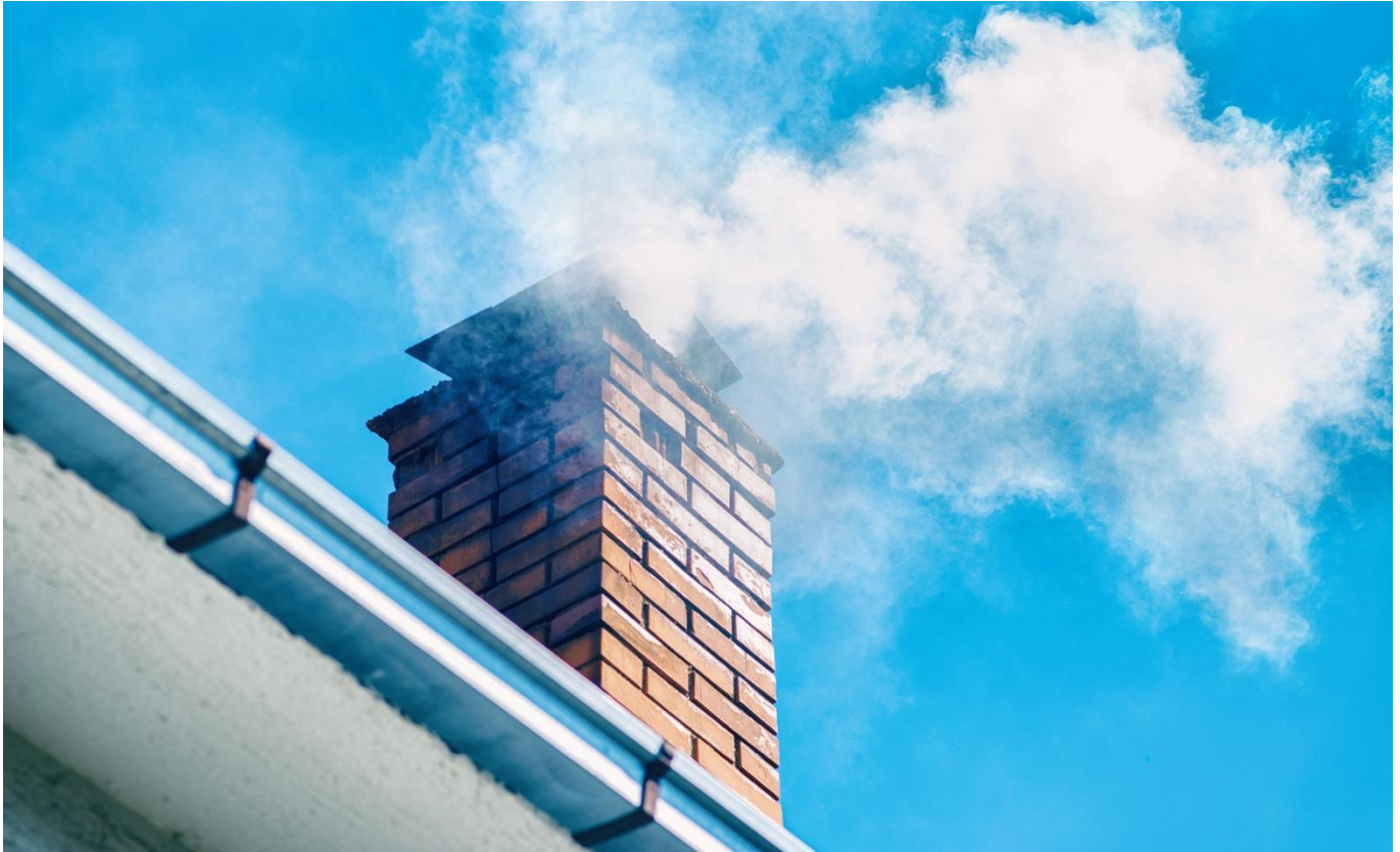
Wood smoke from domestic heating can be a major source of urban air pollution.

Since 2017, the University of New England and Armidale Regional Council have partnered to deploy 'Purple Air' monitors to measure air quality across the town of Armidale, New South Wales. The aim of the project was to understand spatial and temporal variations in particulate pollution associated with smoke from domestic woodfire heating.