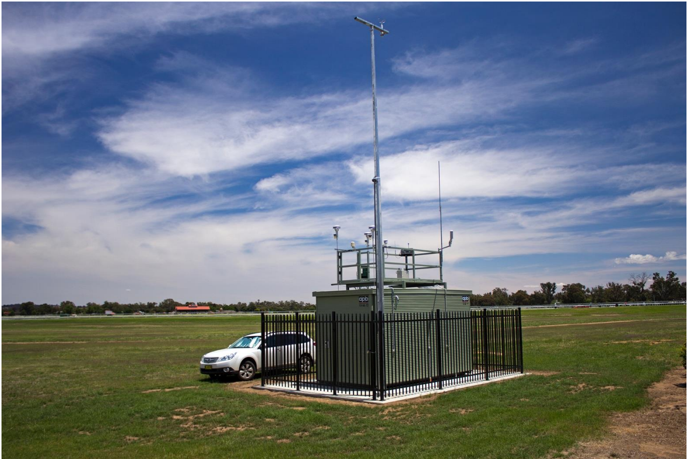
A regulatory ambient air quality monitoring station in Wagga Wagga (NSW), part of the NSW government's state-wide monitoring network.

The NSW Department of Planning (DPE) manages a state-wide network of air quality monitoring stations that measure all notable air pollutants featured in the National Environmental Protection Measure for ambient air quality (Air NEPM). Stations incorporate high-performance, scientific-grade reference instruments that are installed and operated according to international and national standards for regulatory ambient air quality monitoring.