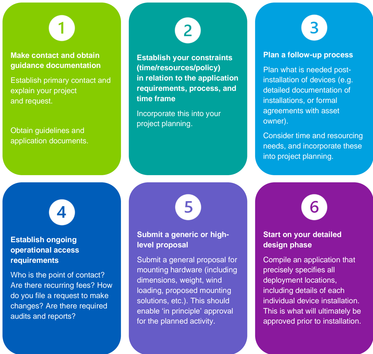
Figure 2. Steps in the process of obtaining relevant access and permissions

Use Table 9 to establish a basic plan for gaining permissions and approval for each type of selected mounting infrastructure, and mark on the checklist when each action is complete.